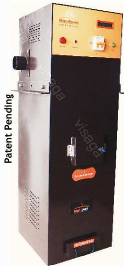
Napiburn - Inci 100+

Napiburn Inci 100+ is the most advanced Sanitary Napkin Incinerator in the world. For the first time, the product comes with Smoke Removal System after lot of extensive research & development. Inci 100+ comes with a lot of value added features for user friendly operation, hassle free maintenance and efficiency for long running.